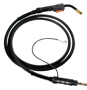
HR-100 Replacement MIG Gun 285033 Comes in 10 ft. (3 m) length with liner for .030-.035 in. (0.8-0.9 mm) diameter wire.