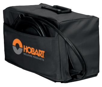
Protective Cover 195186 Weather-resistant nylon resists stains and mildew while protecting the finish of your welder.