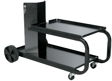
Small Cart/Cylinder Rack 194776 Designed for portable MIG welders. Accommodates large and small gas cylinders.