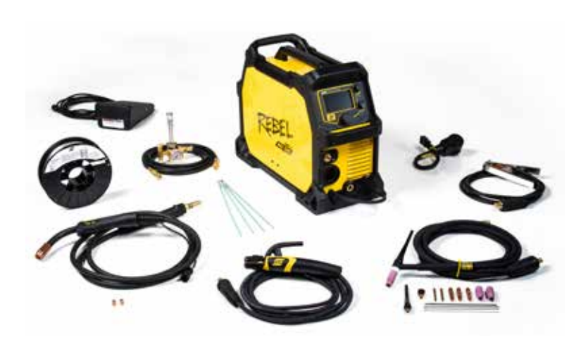
Rebel EMP 205ic AC/DC and accessories.