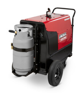
Ranger 305 LPG with factory undercarriage, welding gas cylinder/LPG tank holder and LPG tank holder. (LPG tank not supplied by Lincoln Electric.)