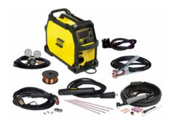
Rebel EMP 215ic complete package.