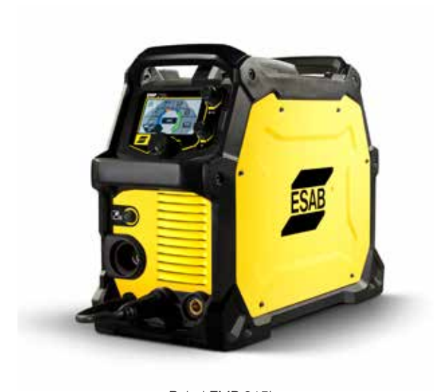
Rebel EMP 215ic