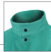
Standup welder's collar