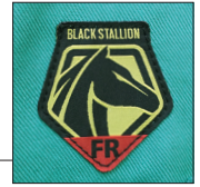
Easy ID FR label