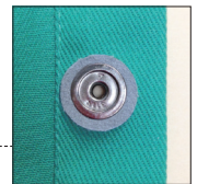
Leather reinforcements on all snaps