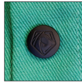
6 convenient front snaps