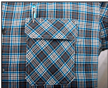
CHEST POCKETS include protective flaps with snap closure

This Flame-Resistant Cotton Work Shirt is recommended for light welding applications only. Flame-resistant garments may not perform properly if soiled or tattered. Keep properly cleaned to maintain flame-resistant properties. Follow care labels attached to garment.