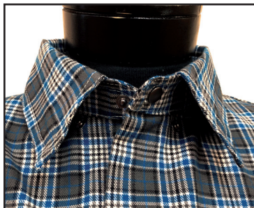
METAL COLLAR SNAPS promote a professional uniform appearance