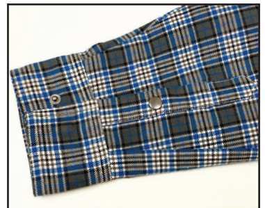
DURABLE METAL SNAPS on front; adjustable metal wrist snaps