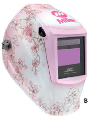
Burn & Blossom™ 296756