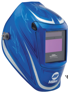
'64 Custom™ 296751