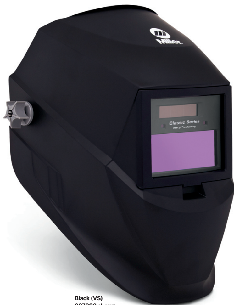
Black (VS) 287803 shown.