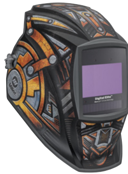
Gear Box™ 289844