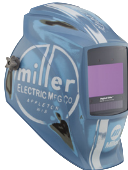
Vintage Roadster™ 289764