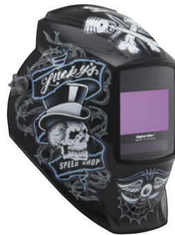
Lucky's Speed Shop™ 289756