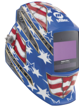
Stars and Stripes™ III 289759