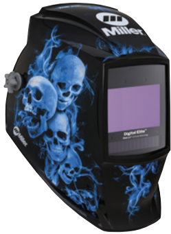
Blue Rage™ II 281010