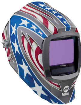
Stars and Stripes™ 288420