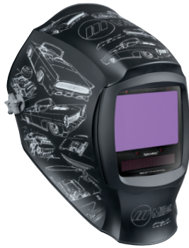
'22 Custom Kindig-it 292933