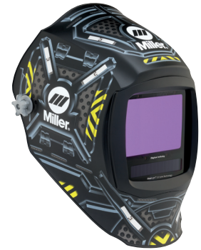
Black Ops™ 289715