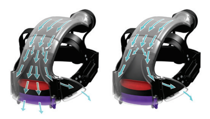
First baffle (Red) - controls ratio of air over forehead vs temples

The VIKING 3350 XG PAPR features a unique, patented airflow design. The airduct is integrated into the top of the headgear and features two air flow baffles, which the user can adjust to change the direction and distribution of the set air flow. This feature maximizes operator comfort and helps prevent eye dryness.