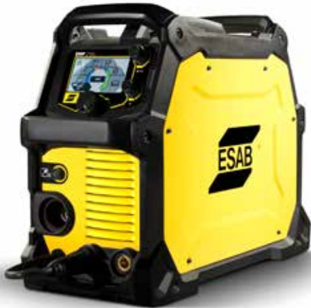
Rebel EMP 215ic