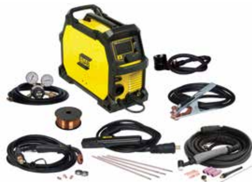
Rebel EMP 215ic complete package.

When choosing a top-performing welding machine you need top-performing ESAB Filler Metals. Learn more at esab.com/fillermetals today.