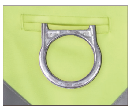
Cablenotch™ access slot for pass-through of fall protection harness