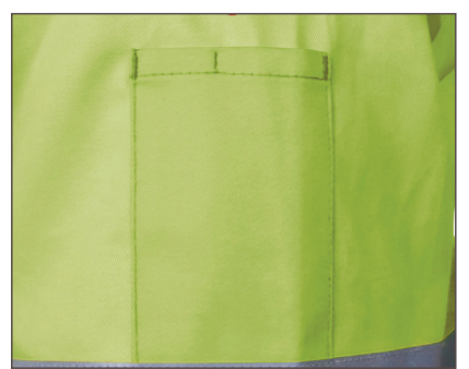
Scribe pocket on left sleeve holds pen, markers, soapstone