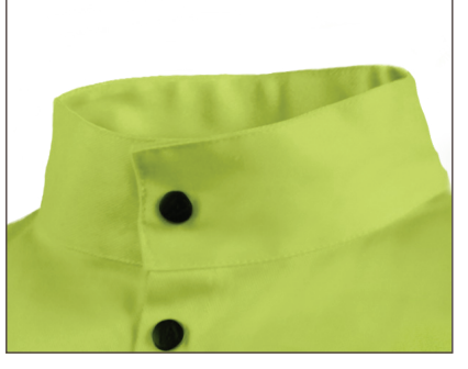
Standup Welder's collar helps protect neck