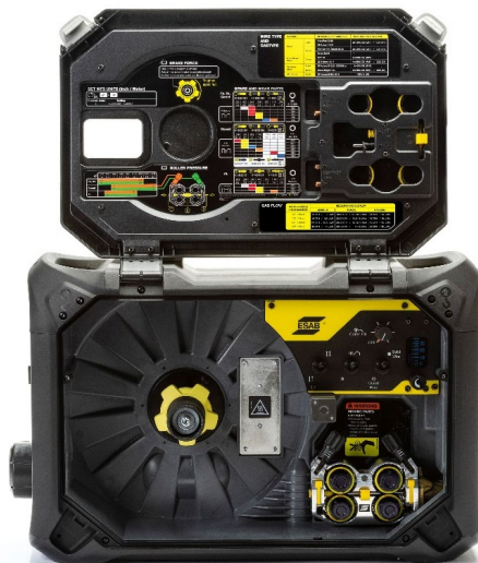
Internal LED lights and intergrated storage for wear parts in lid