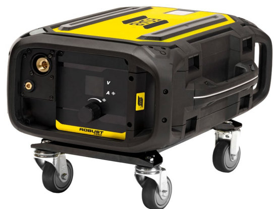
Wheel Kit works with feeder horizontal or vertical