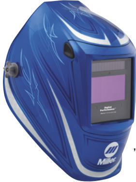
'64 Custom™ 289807