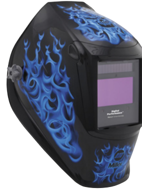
Blue Rage™ 289802